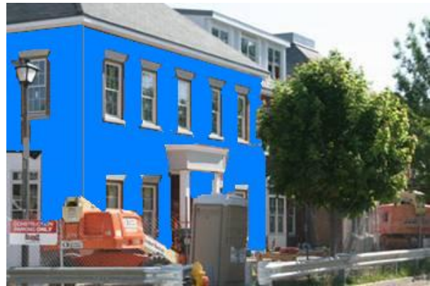
Future \Phi\Delta\Theta , artist's rendition