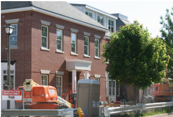
Current \Phi\Delta\Theta House

The Phi Delt house is near completion and should be ready for Phi Deltas to study in within a matter of months. Local rumor has it that when finished, Phi Deltas will paint the house blue (see this page for artist's rendition). The TKE and Phi Psi houses are still ugly as crap, though supposedly they are working on plans for new houses of their own.