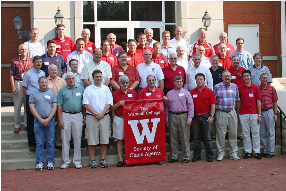
September, 2005 – 50 th Anniversary of the Society of Wabash College Class Agents