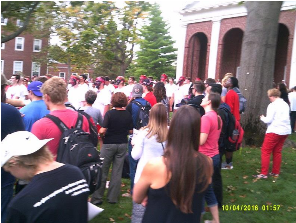
Sigma Chi (with black and red faces) won Chapel Sing. Good, but the glee club sounded better.

And that will wrap it up. If you are on Facebook, friend me so I can capture your outs and abouts. Otherwise, I might have to do some cold calling. So send updates. Contribute if you can. Refer a future Wabash man. And mainly, have fun . Life is short. Get those health screens.